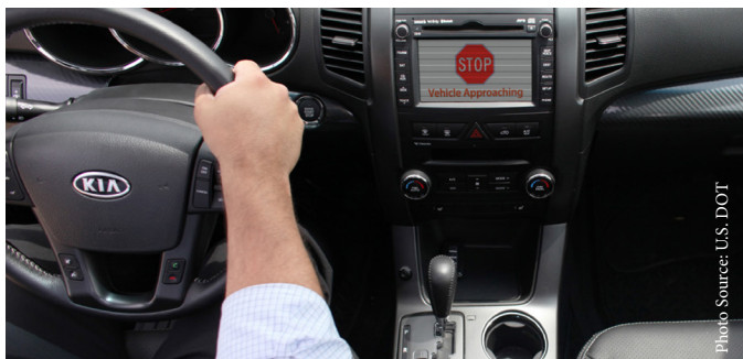
With connected vehicle technology, drivers get warning messages in their vehicles when a potential crash is imminent.

Different communications technologies (satellite, cellular, dedicated short-range communications) may be utilized depending on the performance requirements of the connected vehicle applications. Cars, trucks, buses, and other vehicles can “talk” to each other with in-vehicle or aftermarket devices that continuously share important safety and mobility information. Connected vehicles can also use wireless communication to “talk” to traffic signals, work zones, toll booths, school zones, and other types of infrastructure. The vehicle information communicated does not identify the driver or vehicle, and technical controls have been put in place to help prevent vehicle tracking and tampering with the system.